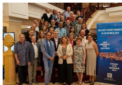
Figure 1: IUSTI-Europe Council Members, Council Meeting Malta 2023

In 3 plenary sessions, 5 symposia, 9 workshops and 4 abstract driven sessions a selection of topics was covered. There was an impressive line-up of highly acclaimed international speakers who informed on all aspects of STIs, including its clinical issues. This year the program was focused on health policies to improve the sexual health outcomes of socially disadvantaged groups. The social events were wonderful and gave us an insight in the beautiful isle of Malta.