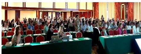
Figure 3: IUSTI-Europe STI-course in Malta 2023

The next Advanced course of IUSTI Europe will be held at the next IUSTI Europe conference in Zagreb, September 11-14, 2024, and is scheduled on September 11, the day of the opening ceremony of the conference with another attractive programme on „Genital Candidiasis and HPV infections: How to solve problems“.