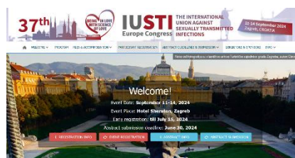
Figure 2: Congress Website Zagreb 2024

Please visit the congress website https://www.iusti-europe2024.org/ and register for the main IUSTI-Europe event 2024!