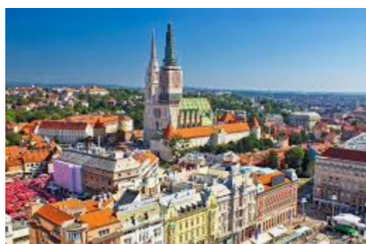
Figure 5: The City of Zagreb

It was very pleasant to discover, in visiting Zagreb, a most welcoming city with the preservation of an authentic central European atmosphere. No large multiple stores in the city centre, but a good selection of smaller shops, plenty of street cafes, parks, and central European style beautiful buildings and streetscape. Everywhere we went, people were friendly and welcoming. Prices were well within European levels.