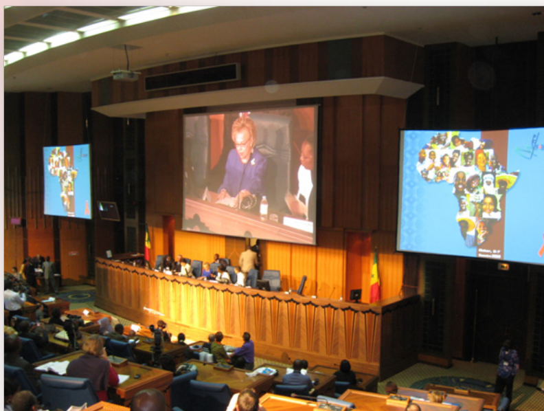
The main auditorium at the 15 th ICASA

some African countries, this has resulted in fewer people becoming newly infected with HIV and fewer people dying. There were several key meetings and events in the last 25 years related to the history of HIV/AIDS on the continent, such as the Abuja Declaration on HIV in 2001, the creation of the Drug Access Initiative, and the launch of Africa's first national AIDS treatment programme in Botswana. High quality scientific research undertaken in Africa has made a major contribution to