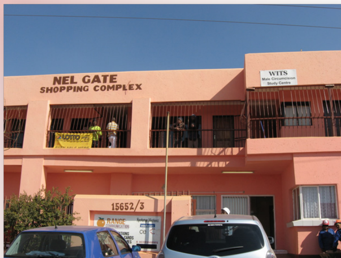
The Bophelo Pele male circumcision centre in Orange Farm

After more than 7000 male circumcisions, no death