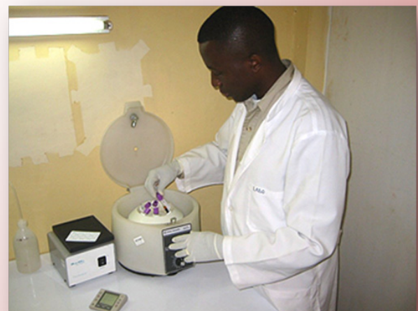
Laboratory technologist processing blood specimens in the trial