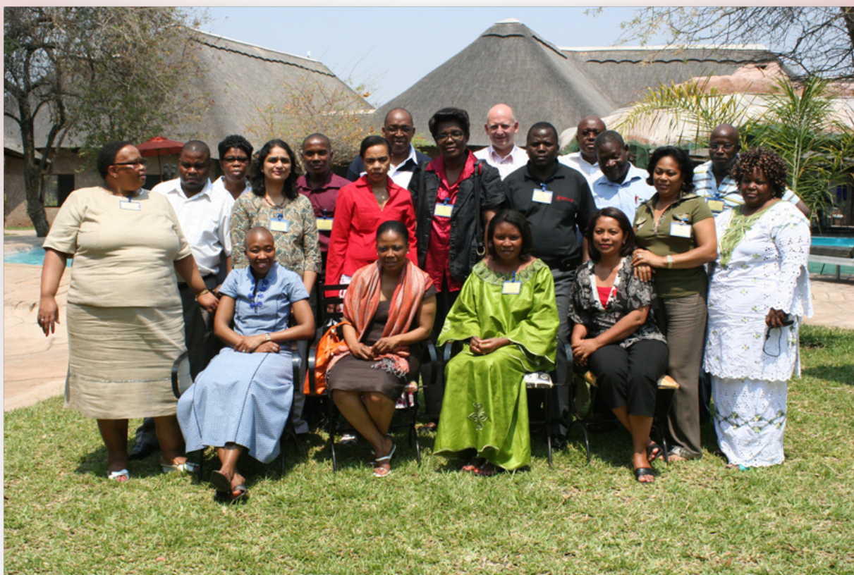
The technical team and SADC secretariat staff