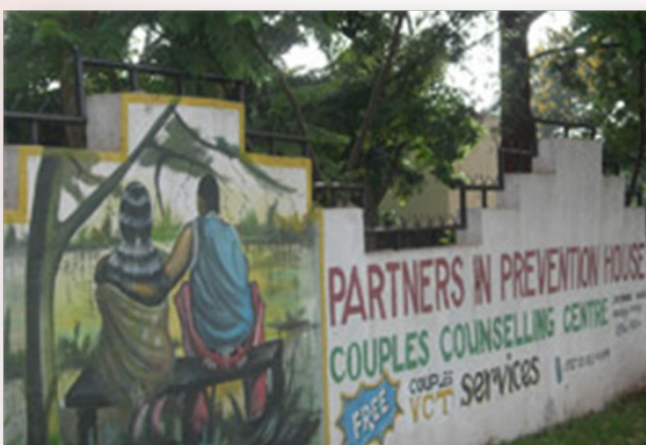
Couple counselling site for the Partners in Prevention HSV/HIV Transmission trial

The results of this trial, which failed to show any benefit from suppressive acyclovir therapy in terms of HIV transmission to an HIV seronegative partner, follow other recently published clinical trials in Africa and other parts of the world, which failed to show a protective benefit for HIV acquisition in HSV 2 seropositive and HIV seronegative women and men-who-have-sex-with-men (MSM). Further analysis of the data of these RCTs is required to try and understand the results in the light of the strong epidemiological evidence for a cofactor role of HSV2 in HIV transmission.