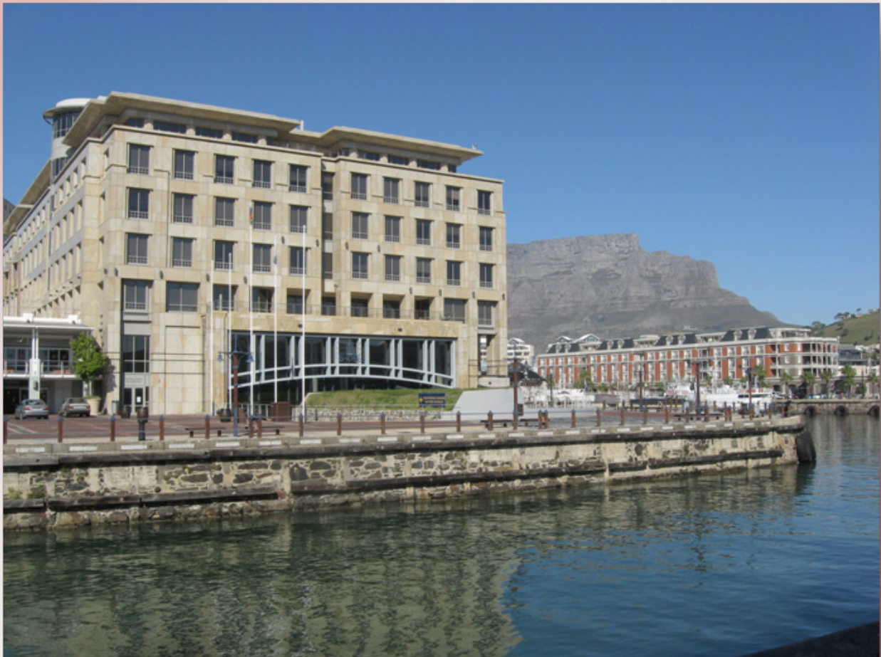
Above: The Conference Venue at the Cape Town Waterfront with Table Mountain in the background

The plenary sessions will cover rapid diagnostic tests for STIs, prevention of mother to child transmission of HIV, biological drivers of the HIV epidemic, sexual networks and the internet, male circumcision, HIV vaccines and how to use information technology (IT) in novel ways to improve STI/HIV clinical practice. The symposia will cover men-who-have-sex-with-men, STI bacterial typing, STI/HIV public health interventions, HIV treatment approaches, condoms, STI/HIV behavioural interventions in Africa, roll out of rapid tests for syphilis screening of pregnant women, updates in STIs and IT, challenges to effective STI syndromic management, HPV vaccination and HPV clinical disease, commercial sex work, STI treatment as a component of HIV prevention, and finally IUSTI global challenges. The conference will conclude with a closing lecture by Professor King Holmes from the University of Washington (Seattle, USA) on emerging multi-component STI/HIV prevention strategies. Professor Holmes will take over as IUSTI World President from Professor Angelika Stary at the end of the meeting.