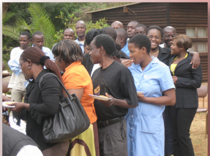
Zichire staff enjoying the post-course tea party