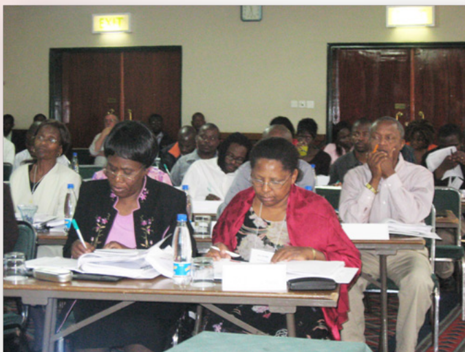
Delegates on the training course

Over 60 delegates registered as IUSTI-Africa associate members during the two days of the course.