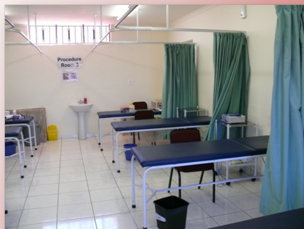
The surgical ward at the Bophelo Pele Male Circumcision

The Bophelo Pele project is tailored to be a safe and cost efficient model for rolling out surgery on a large scale as a public health intervention in a semi-urban setting where a high volume of surgeries is required. This project demonstrates that the roll-out of adult MC can be done safely and inexpensively according to international recommendations.