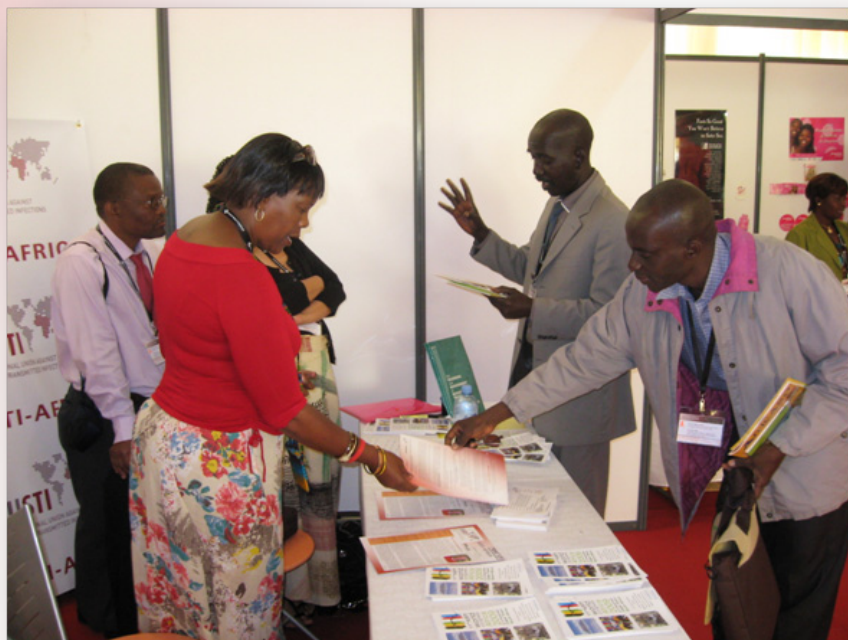
Recruiting new members at the IUSTI-Africa stall

An area of emerging research concerned men-who-have-sex-with-men (MSM). Several MSM studies, including research from South Africa, Malawi, and Nigeria were presented. These presentations highlighted the enhanced risk of MSM individuals to STI/HIV infection, as evidenced by high HIV prevalence compared to ‘background populations’, and the role of bisexual men in heterosexual bridging to the MSM community through concurrent partnerships with individuals of both sexes. Homosexuality remains punishable by imprisonment in many African countries, and by death in a few. Criminalisation of MSM sexual orientation results in individuals taking higher risks in their sexual encounters and results in poor local intelligence on HIV epidemics. The lives of African MSM are characterized by denial, violence, and stigmatization. HIV programmes in many countries remain heavily heterosexual and female focused and more recognition of MSM as a risk group is needed.