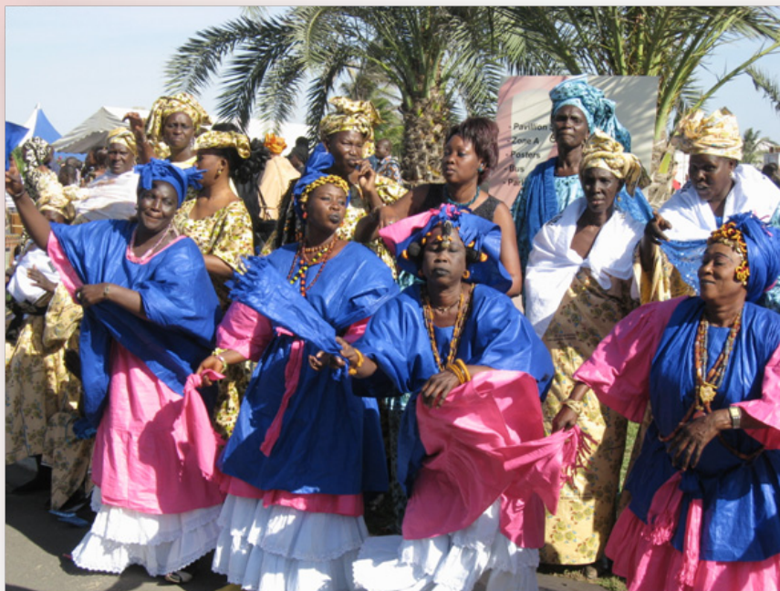
Senegalese dancers outside the conference venue on the opening day