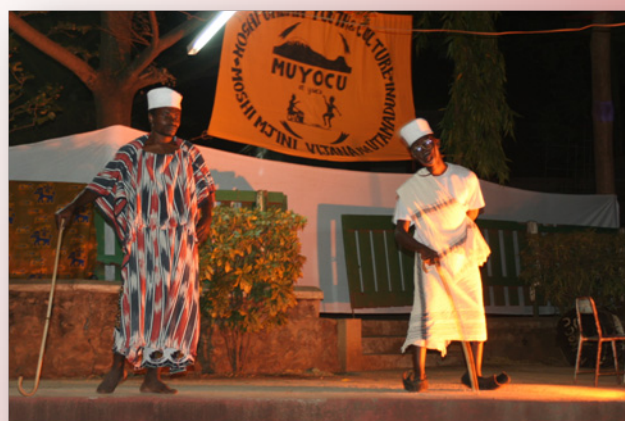
Youth performing their play on slavery