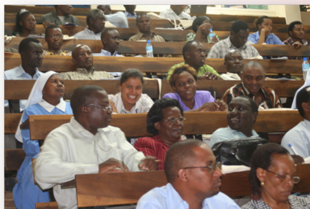
Delegates at the conference