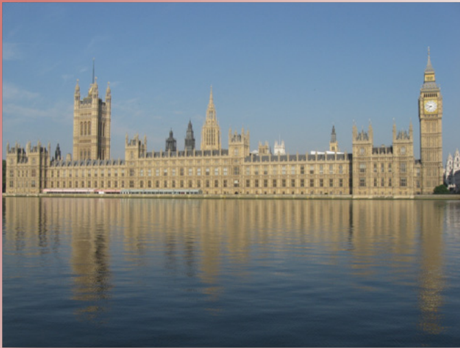
The House of Parliament, London