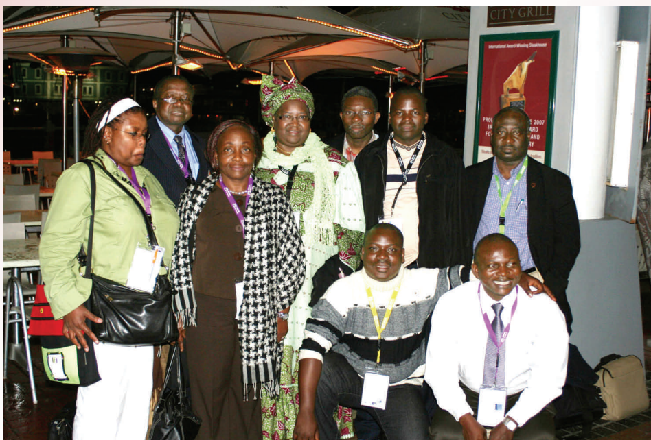
Figure 11: Some of the founding members of IUSTI Africa Region's new core team