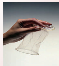
The polyurethane FC1/ FC female condom

The first FC made by the Female Health Company (FHC), is known as Reality ® and is now also referred to as the FC Female Condom ® or the FC1 and is marketed under various brand names 1 . This FC is made from polyurethane which is odourless, rarely causes allergic reactions, and, unlike latex, may be used with both oil-based and water-based lubricants. The FC1 has two flexible rings, one at the closed end of the condom that is used to insert the device and helps keep the condom in place during sex. A ring at the open end of the condom stays outside the vagina, lies flat across the genital area and ensures the condom stays in place; it is 17 cm in length when unrolled.