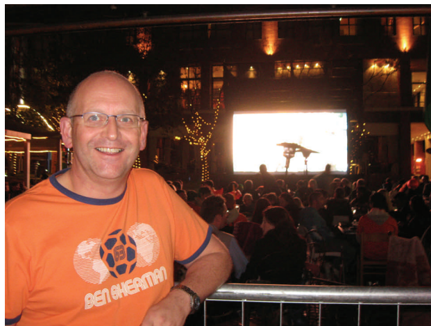
The Regional Director watching the Holland v. Uruguay 2010 World Cup match

Following a successful 2010 world cup, South Africa was again in the news recently, this time