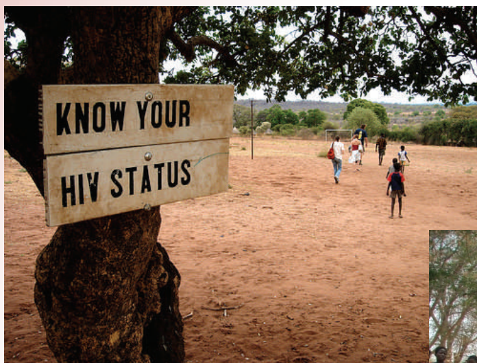
HIV testing sign in Zambia

The household response rate for the 2009 survey was 93% and respondents had to be 15 years and older. HIV/AIDS knowledge was almost universal in Zambian adults, as exemplified by the facts that 99% of adults had heard of HIV/AIDS and about 95% of respondents in both urban and rural areas knew HIV/AIDS could be avoided (an increase from 81% in 2000). The proportions of respondents who spontaneously mentioned the ABCs of HIV prevention had decreased since the 2005 survey. Although over 80% of respondents recognized that consistent condom use was a means to prevent HIV transmission, only 45% of women and 53% of men indicated that condoms were “very effective”. Several respondents still accepted common misconceptions about HIV being transmitted by mosquitoes (36%), witchcraft (36%) or sharing food (21%).