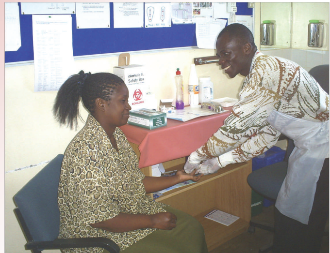
Lighthouse lay counselors demonstrating whole blood rapid HIV testing

The proportion of STI patients with a known HIV status is still very low despite the incorporation of HTC in the 2008 STI case management guidelines for Malawi. The integration of HTC services in the management of STIs within the same facility increases HTC uptake. A referral mechanism should be put in place for HIV positive STI patients to access HIV care services.