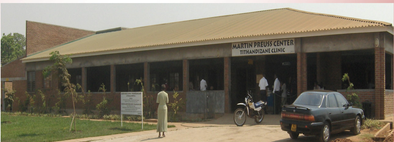
The Martin Preuss Centre at Bwaila Hospital (Lighthouse Clinic, Lilongwe Malawi)

STI clinical case management is provided by the Lilongwe District Health service providers while HTC is provided by the Lighthouse dedicated lay counselors. The two teams have been integrated to form an STI case management team. From June 2009, Lighthouse placed the lay HTC counselors (non medical) in the STI clinic at Bwaila Hospital. All STI patients were sensitised on the benefits of HTC using a standard Group Pre-Test Education (GPTE). As part of their STI case management, all STI patients were directed into an HTC room within STI clinic for the test. STI patients were given opportunity to “opt-out”. Soon after testing and counselling, patients were sent back into the clinic rooms to complete the STI case management and HIV positive individuals referred for ART or other support services at Martin Preuss Centre.