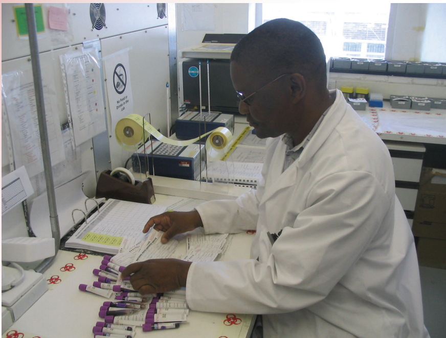
Figure 3. The campaign will result in new individual starting antiretroviral therapy with supportive CD4 count monitoring

The national launch for the HCT Campaign took place on Sunday, 25 April 2010 at Natalspruit Hospital in Ekurhuleni, Gauteng Province. The State President, Minister of Health, national Ministers and Provincial MECs, as well senior leaders of Government Departments and civil society sectors were in attendance. Provincial launches subsequently took place on Friday, 30 April 2010 under the leadership of Provincial Premiers and Provincial Councils on AIDS (PCA). During the following months, the campaign has focused intensively on all 52 health districts in the country as determined by provincial capacity.