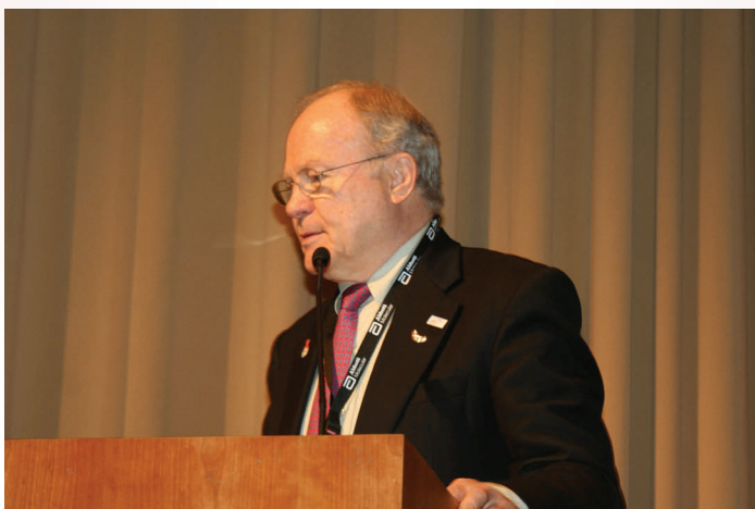
Figure 6. Professor King Holmes delivering his closing lecture.

The symposia covered STI/HIV in men-who-have-sex-with-men, STI bacterial typing, STI/HIV public health interventions, HIV treatment approaches, condoms, STI/HIV behavioural interventions in Africa, roll out of rapid tests for syphilis screening of pregnant women, updates in STIs and IT, challenges to effective STI syndromic management, HPV vaccination and HPV clinical disease, commercial sex work, STI treatment as a component of HIV prevention, and finally IUSTI global challenges. The congress concluded with a closing lecture by Professor King Holmes from the University of Washington (Seattle, USA) on emerging multi-component STI/HIV prevention strategies (Figure 6).