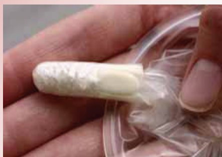
The PATH- Woman's Condom

The PATH Woman's Condom is currently under development 7 . It is made of urethane and inserts like a tampon with a dissolving cap made of PVA (polyvinyl alcohol similar to C-film). The body of the condom is tucked into the cap which dissolves after insertion. It is non-lubricated and can be used with both oil and water based lubrication or with none, depending on the users preference. It will be marketed with a sachet of silicone lubrication. This condom was developed with a user-driven process, evaluated by couples in 4 countries for key acceptability parameters such as ease of insertion, comfort, sensation and stability. Acceptability trials have shown the PATH Women's condom to be acceptable to users 8 . It is being transferred to a Chinese manufacturer in 2008, and it is anticipated that the final design will move forward for WHO and USFDA approval in the next 2 years.