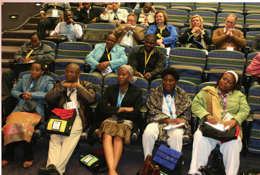
Figure 10: IUSTI Africa Regional Meeting.

The IUSTI 2009 World Congress was strategically held in Africa in order to assist with the building up of the IUSTI Africa regional network. In addition to the appointment of three African STI/HIV specialists to the IUSTI World Executive Board, an IUSTI Africa core team was established to enhance the work of IUSTI within the Region.