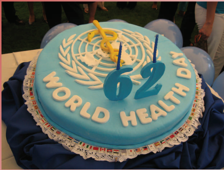
Fig. 1 WHO's 62nd birthday cake