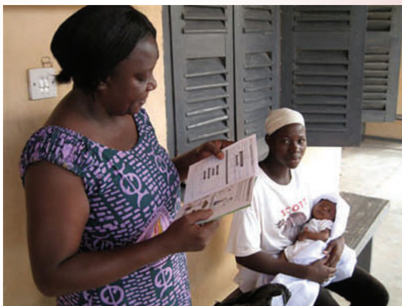
Congenital syphilis can be prevented by screening pregnant women

However, in comparison to non-treponemal tests, POC tests cannot distinguish between active and past-treated infections, which may limit their usefulness in areas with high syphilis or yaws prevalence (such as some areas in the Central, Eastern and Ashanti regions), or when patients need to be screened repeatedly, as in successive pregnancies. Therefore, assessment of their impact and cost-effectiveness in eliminating congenital syphilis through scale-up programmes is recommended by the World Health Organization's STD Diagnostics Initiative (SDI). Research is warranted in Ghana, where the Ghana Health Service has embarked on a revamped programme to control maternal syphilis using POC tests, but where endemic treponemal infections also coexist.