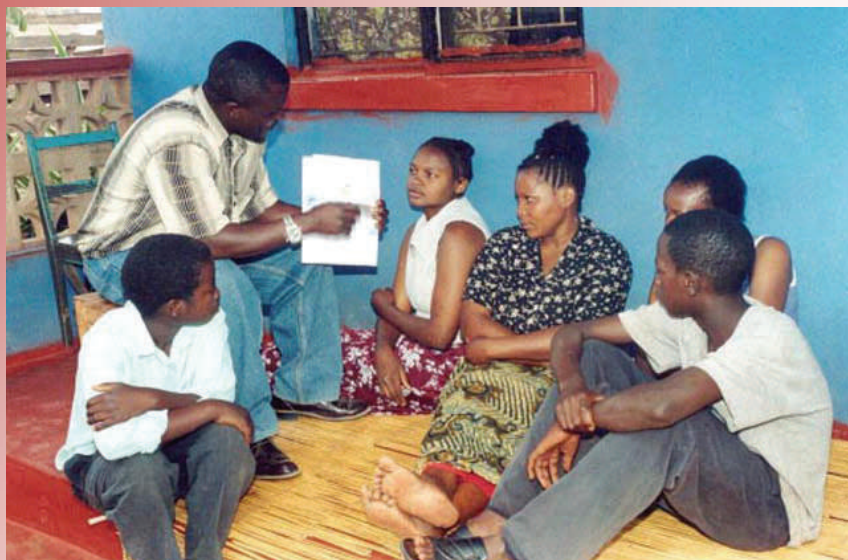
A peer group educator explains about HIV testing in Zambia

The proportion of respondents who knew where to go to get an HIV test increased from 84% to 94% from 2005 to 2009. Although improved from the 13% reported in 2005, the proportion tested remains low with only 46% of 2009 survey respondents reporting a previous test. The proportion of females who tested for HIV during antenatal care in the past 2 years increased from 14% in 2005 to 67% in 2009.