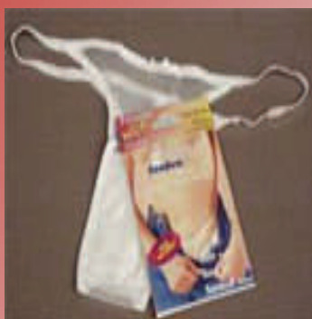
Natural sensations panty condom