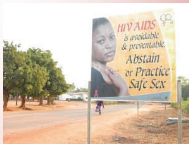
HIV/AIDS awareness sign in Zambia

The decline was primarily seen in the urban areas and remained constant in the rural areas at 3%. Analyzing the trend by gender revealed less men, particularly in the urban areas, reported STI symptoms in 2009 whereas the proportion of women with STI symptoms had increased slightly in the same time period, more so in the rural areas.