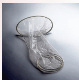
The FC2 Synthetic Latex female condom

The FC2 female condom was also developed by the FHC and became available in some countries in 2005 4 . The CE Mark has been awarded and FC2 completed the technical review process by WHO in 2007 2 ; WHO has approved FC2 for bulk purchases by all UN agencies. The FC2 was approved by the US FDA in 2009.