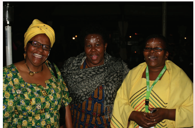
Figure 13. South African Department of Health HIV/STI Programme Managers at the gala dinner.

The gala dinner took place at Moyo's restaurant at the Spier Wine Estate near Stellenbosch, about 30 minutes bus journey from Cape Town. Before the meal commenced, speakers were given a private viewing of the Cheetah outreach programme run on the Spier site (Figure 12). The gala dinner was supported by GenProbe (USA). A variety of food from all corners of the African continent was available at the buffet and African dancers and a marimba band entertained the delegates. Approximately 400 people attended the gala dinner (Figure 13). It provided a good opportunity for networking and appreciation of African culture.