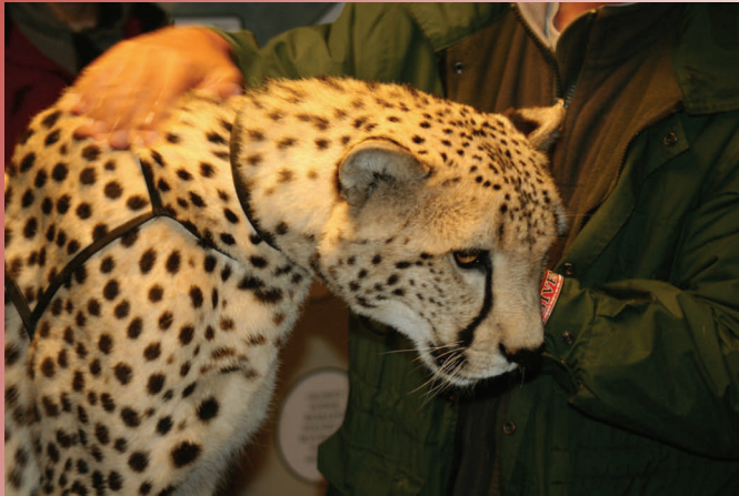
Figure 12. The Spier cheetah outreach project.