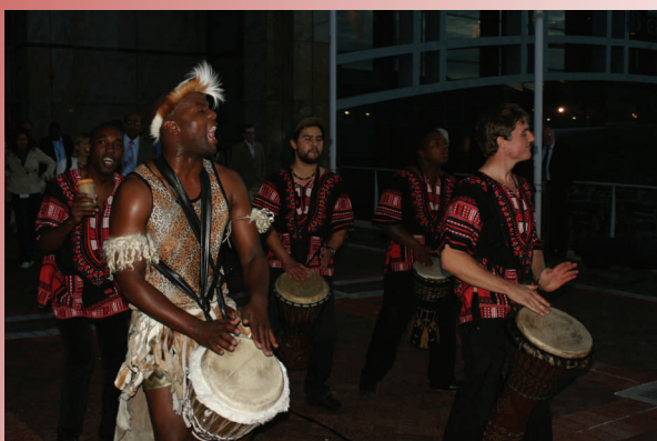
Figure 4. Zulu dancers at the opening ceremony.

Following the scientific part of the opening ceremony, the delegates were treated to a performance of African drumming and Zulu dancing (Figure 4). The IUSTI World President, Professor Angelika Stary (Austria) officially opened the congress by firing a cannon on the site of the old Dutch city walls (Figure 5).