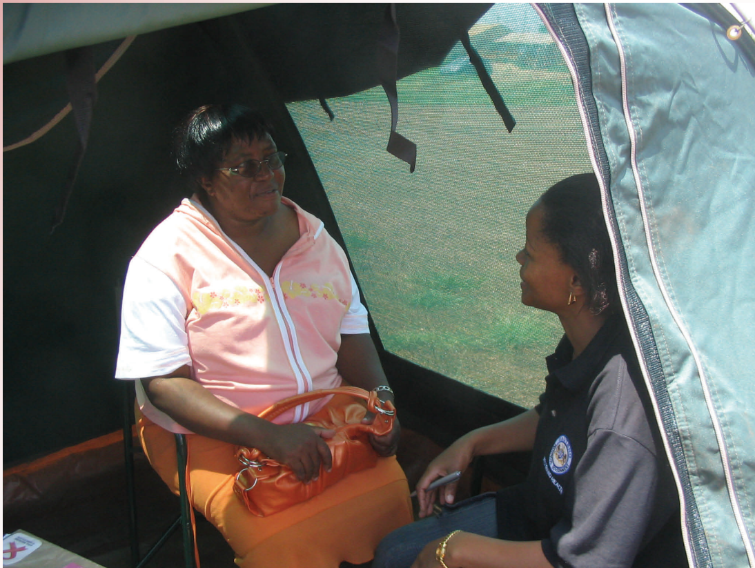
Figure 1. The HIV counselling and testing will take place all over South Africa

Mr. Jacob Zuma, the President of South Africa, made a number of pledges in respect of national HIV/AIDS policies on World AIDS Day on the 1 st December 2009. One such pledge was for the country to embark on a large -scale national HIV Counselling and Testing (HCT) Campaign under the leadership of the South African National AIDS Council (SANAC) and the National Department of Health (NDoH).