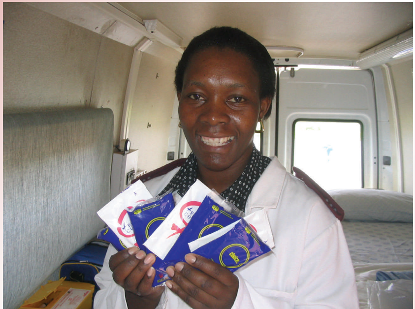
Figure 2. Condom promotion will be an essential part of the HCT campaign

Although the campaign will be co-ordinated by the NDoH and SANAC, it will also be supported by a number of initiatives from several non-governmental organisations (NGO) and the private sector. As just one example, the Treatment Action Campaign (TAC), so instrumental in campaigning for better healthcare for people living with HIV over the past decade, will for example provide HCT messaging to at least 730,000 people through various initiatives. The HCT campaign will be promoted through posters, magazine, media and radio interviews. Condoms will be distributed in a number of easy-to-access venues such as taxi ranks, hair salons and schools. Door-to-door campaigns will take place at the community level, consisting of condom distribution and HCT education.