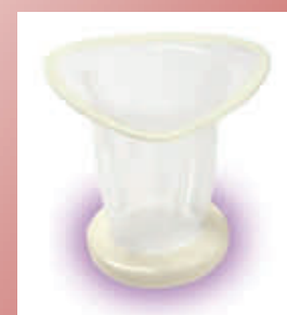
Reddy VA w.o.w/ L'amour female condom

The VA w.o.w (worn of women) FC, also known as the Reddy female condom, is made of latex and encases a sponge at the closed end of the condom. 5 The outer anchoring structure which stays outside the vagina is in the form of a triangular shaped frame. The sponge is used for insertion and the condom is 90mm in length. The VA FC has received EU approval and carries the CE Mark. This FC does not have WHO or USFDA approval yet. The VA condom is currently available in some African countries and Brazil and is marketed in these countries under the L'amour brand. It comes lubricated with silicone oil but can only be used with other water based lubricants.