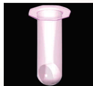
The Cupid female condom

The Cupid female condom made by Cupid Ltd, manufacturers of male condoms, is made from latex with a foam sponge for insertion. The outer frame is octagonal. This condom comes in a natural and a pink colour and is 155 mm in length. It is one of the newest FC products and is currently only available in India. 6