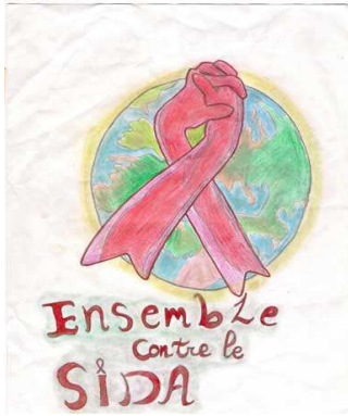
Moroccan HIV/AIDS poster (winner UNESCO 2010 competition for the Arabs States region) [http://portal.unesco.org/en/ev.php-URL_ID=47734&URL_DO=DO_TOPIC&URL_SECTION=201.html]

have sex with men (MSM) in Morocco. For that purpose 657 MSM from Agadir and Marrakech were recruited using respondent driven sampling as a sampling method. Sera from recruits were tested for HIV1+2 and HSV2. The high prevalence of HSV2 among HIV-positive MSM suggests that an increased focus on HSV2 control in the management of HIV among MSM may be recommended in the Moroccan context.