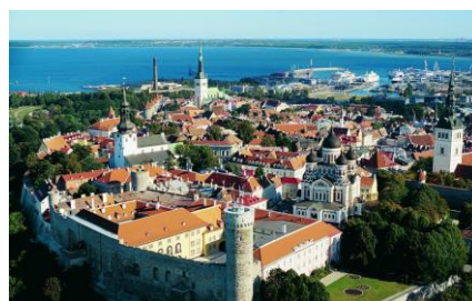
Tallinn is preparing to host IUSTI-Europe 2019 Congress

Abstract submission is now open for oral and poster presentations. The deadline is June 1st.