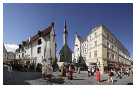
Tallinn Old Town – UNESCO World Heritage Site

The organisers are also determined to offer a social programme that will make the Conference a memorable event emotionally. IUSTI-Estonia is pleased to welcome colleagues from abroad by hosting a ball in the Estonian National Opera House. Sight-seeing tours will give participants a chance to see the UNESCO World Heritage Site – Tallinn Old Town, the best-preserved mediaeval city in Europe, and discover why Estonia's untamed nature leaves visitors breathless. Theatre-lovers can book tickets for the ballet "A Streetcar Named Desire", a bold new take on Tennessee Williams' legendary play.